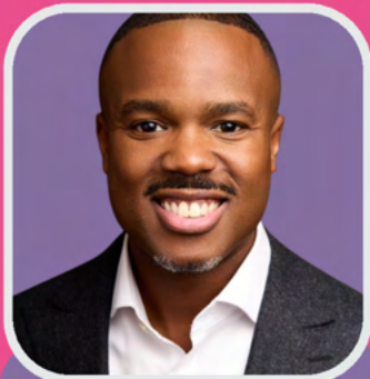
Seldric Blocker Board